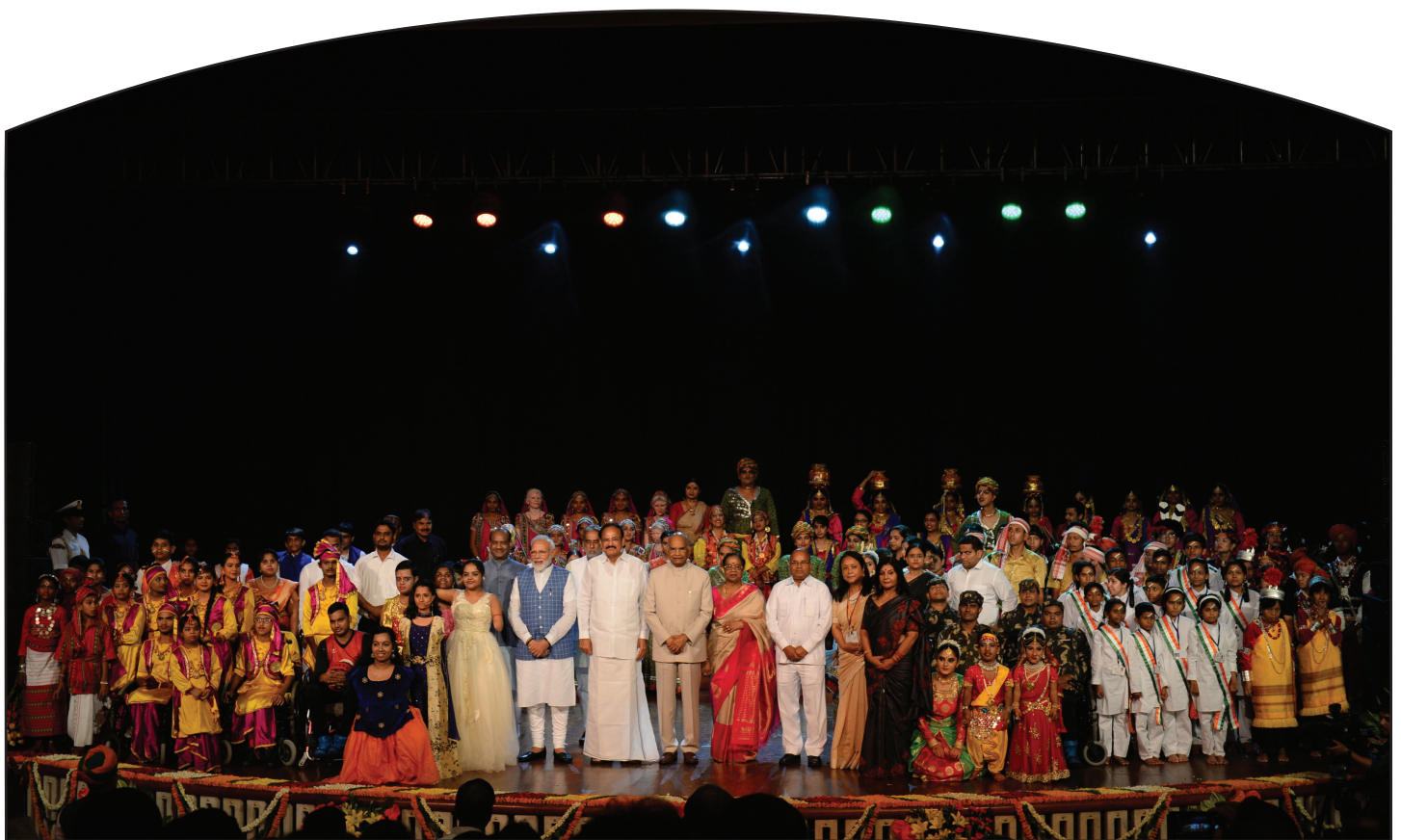
Diya Kala Shakti 'Witnessing Ability in Disability'