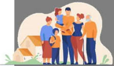
PARENTS/FAMILY AS PARTNERS

Rehabilitative care requires multi-sensory stimulants and activities for motor/physical skills, cognitive skills, communication/language skills, self help/adaptive skills and social/emotional skills through sustained and repetitive Intervention protocols.